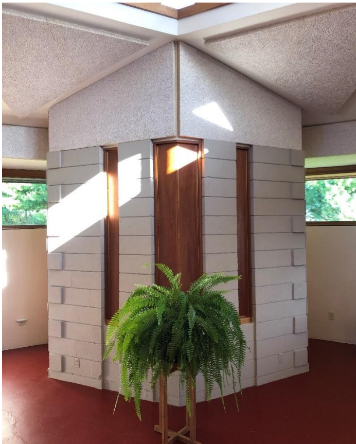
Above: Acoustic panels on the north walls and ceiling of the Assembly Hall were also added.

After all of that, we are happy to report that no more water is infiltrating the building. Additionally, the rebuilding of the exterior chimney and stabilization of the clerestory windows has eliminated our bat problem and will also improve the efficiency of our heating and cooling systems.